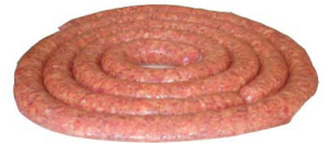
Italian Sausage Rope Mild #2568 | 2/5 LB Hot #6225 | 2/5 LB