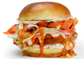
Potato w/Glaze 4" #12736 | 5/12 CT