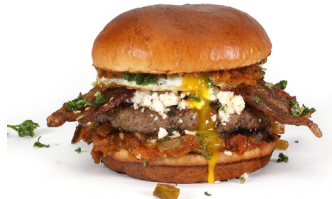
Brioche Bun 4" #12727 | 8/6 CT