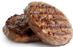
Steak Burger Thick 2-1, 8 oz #13540 | 9 LB