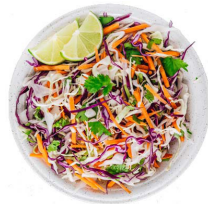
Cole Slaw Cabbage Slaw #14350 | 4/5 LB Oriental #11173 | 5/4 LB *3 day lead time*