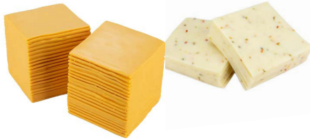
Sliced Cheese American #2879 | 4/5 LB Cheddar #2831 | 8/1.25 LB Pepperjack #2837 | 8/1.25 LB