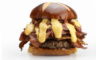
South Side Pretzel Bun 4" #12864 | 8/6 CT