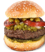
Sesame Bun 4" #14377 | 4/12 CT