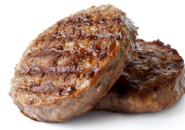
Steak Burger 4-1, 4 oz #13566 | 12 LB