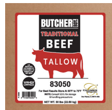
Rendered Beef Tallow #13768 | 50 LB