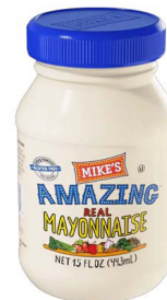
Extra Heavy Mayonnaise #7519 | 4/1 GAL