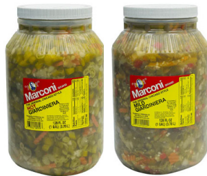
Giardiniera #2918 MILD | 4/1 GAL #860 HOT | 4/1 GAL