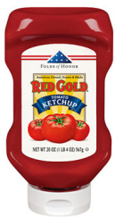
Red Gold® Ketchup #13414 | 16/20 oz