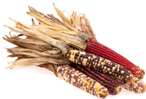
Indian Corn #2097 | Case *pre-order only