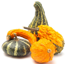
Mixed Gourds (40-60 ct.) #2101 | 1/2 BU