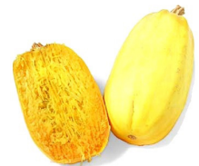
Spaghetti Squash #2370 | 1 1/9 BU