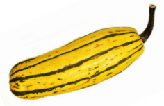
Delicata Squash #8432 | CASE