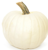
White Pie Pumpkin #13981 | Case