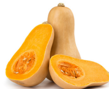
Butternut Squash #2366 | 1 1/9 BU