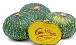
Kabocha Squash #3495 | CASE