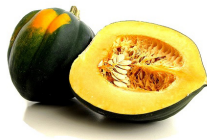
Acorn Squash #2364 | 5 LB