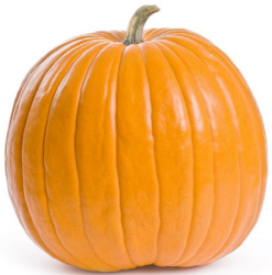
Large Pumpkin #2102 | Piece