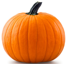
Medium Pumpkin #2103 | Piece