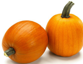
Pie Pumpkin #2105 | Case